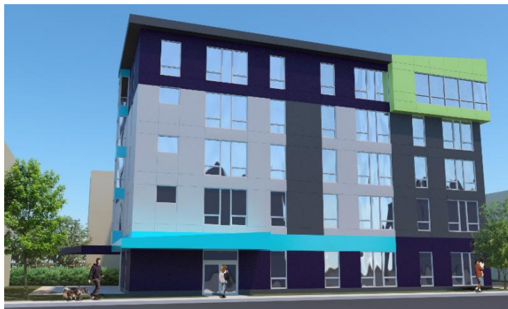
A rendering for an expansion of Belden Apartments set in Chicago's Lincoln Park neighborhood.

Finally, this next project takes us back to our roots with Belden Apartments, our first apartment community located in the heart of the Lincoln Park neighborhood. While the building won a prestigious architectural award in 1982, it is no longer a state-of-the-art structure and the time is right to improve and expand Belden. We