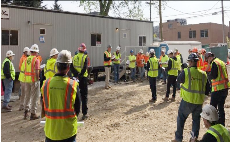
Construction of Midtown Crossing has generated 108 temporary jobs, a boon to the local economy.

two other apartment complexes currently going up in the area, we feel that we are part of a revitalization of the downtown area of Des Plaines.